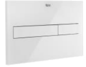
PL7 DUAL (ONE) - Dual flush operating plate for concealed cistern (crystal finish)