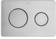
PL10 PRO DUAL (ONE) - Vandal-proof stainless steel dual flush operating plate