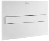
PL7 DUAL (ONE) - Dual flush operating plate for concealed cistern (matt finishes)